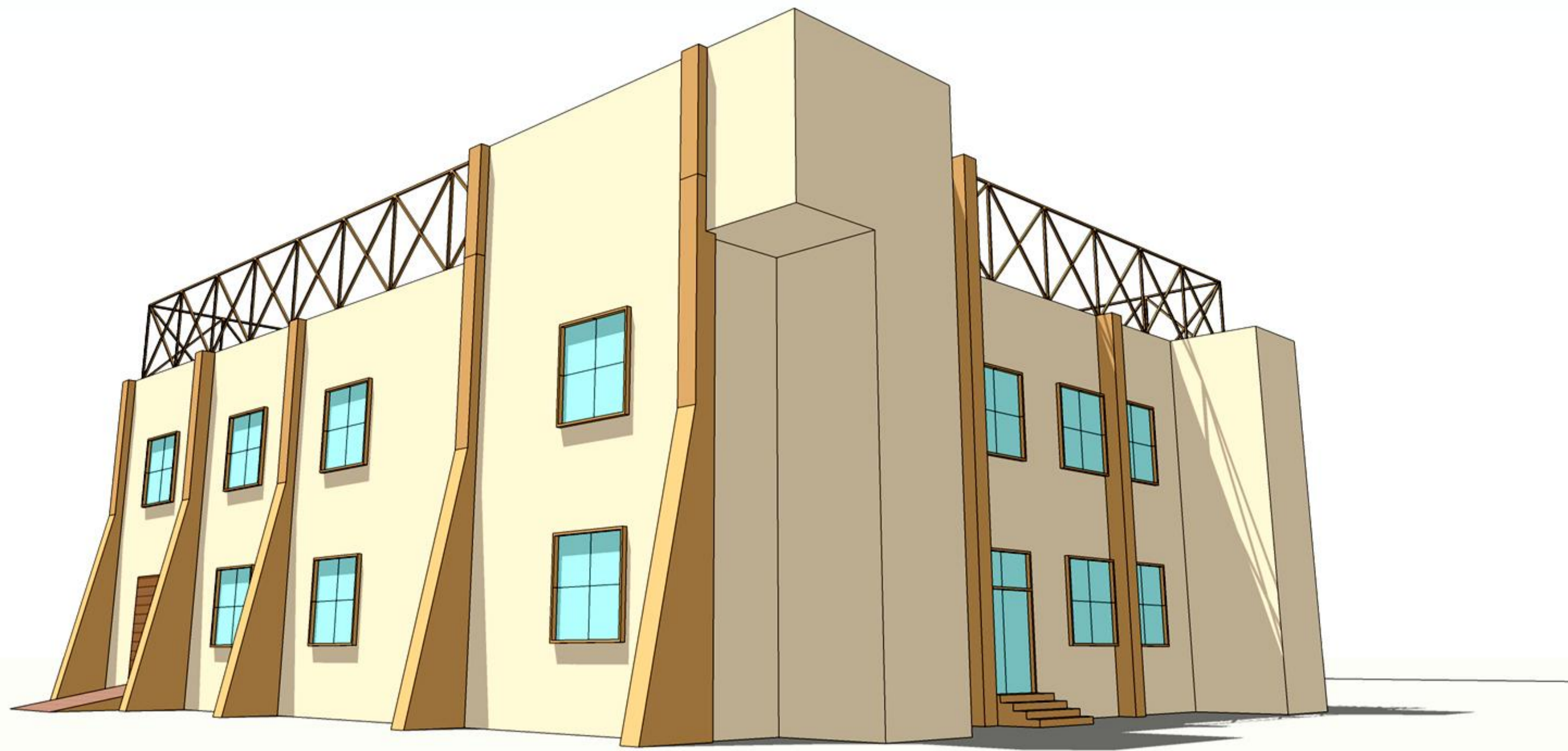
WORM EYE VIEW